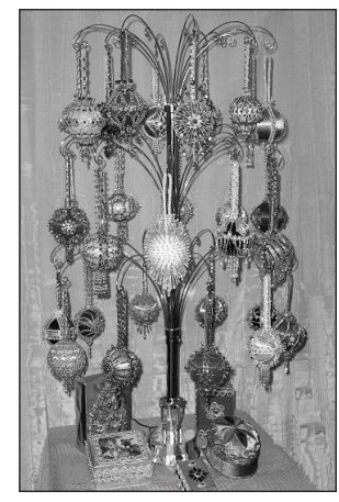
Revolving Tree Stand - 39"

This 72" high rotating tree is similar to the 39" version and is also perfect for displaying up to 120 ornaments. Tree disassembles for easy storage and comes with an AC adapter (no more dead batteries!). Features a gold or silver finish and a removable star. Tree is 24" at its widest, and base measures 24" across. Height includes the star. Perfect for a space where a live tree just won't do.