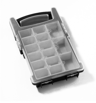
Storage Box $10.00 Black and Yellow Store your leftover items for a future project.

This stand is 12" tall by 6" wide with hanging area dimensions of 9½" tall by 5" wide. This stand is a high quality display piece with a gold finish over brass. Perhaps you would like to enjoy a different ornament each month, highlight your favorite or special ornament. Here is a perfect way to do just that!