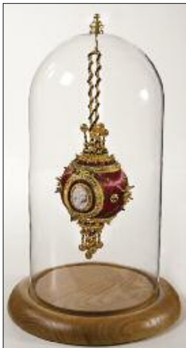
Glass Dome Display with Oak Base